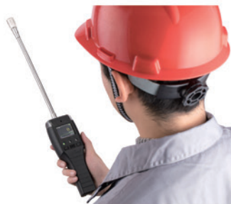
build-in pump gas detector