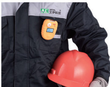
difussion type gas detector

The portable gas detector is small in size and easy to carry. It can be used for workshop routing inspection for side leakage, as well as in confined spaces such as flame operation inspection.