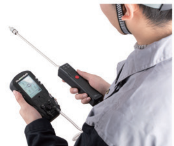
external pump gas detector